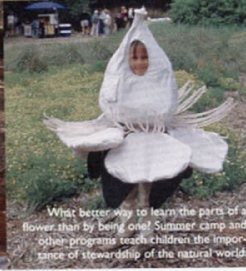
What better way to learn the parts of a flower than by being one! Summer camp and other programs teach children the importance of stewardship of the natural world.

Join us in celebrating true Santa Barbara Treasures—individuals, friends and community members volunteering their time, talents and energy to local nonprofit organizations and programs helping to make a difference.