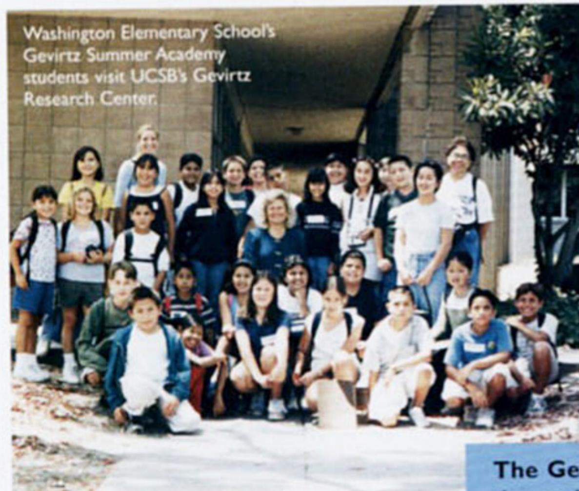
Washington Elementary School's Gevirtz Summer Academy students visit UCSB's Gevirtz Research Center.